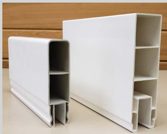
not actual size (size comparison only)